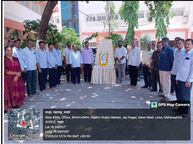
While Teachers and non-teaching staff paying floral tributes to the image of late Prime Minister Rajiv Gandhi