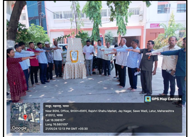
While Taking oath on Anti-Terrorism and Anti-Violence Day